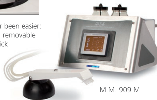
M.M. 909 M