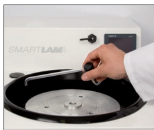
Cleaning has never been easier: spinning function, removable watering pipe, quick removable bowl.