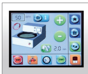
Friendly interface with large touchpanel